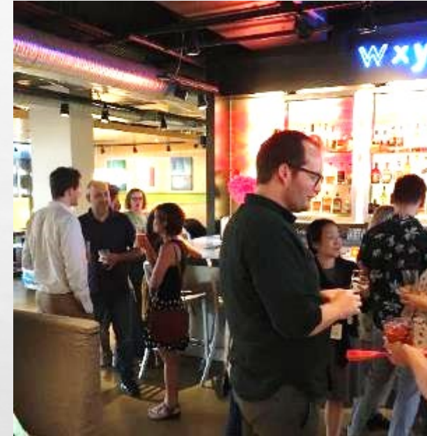
A look back at the DMI 2018 Social Event...