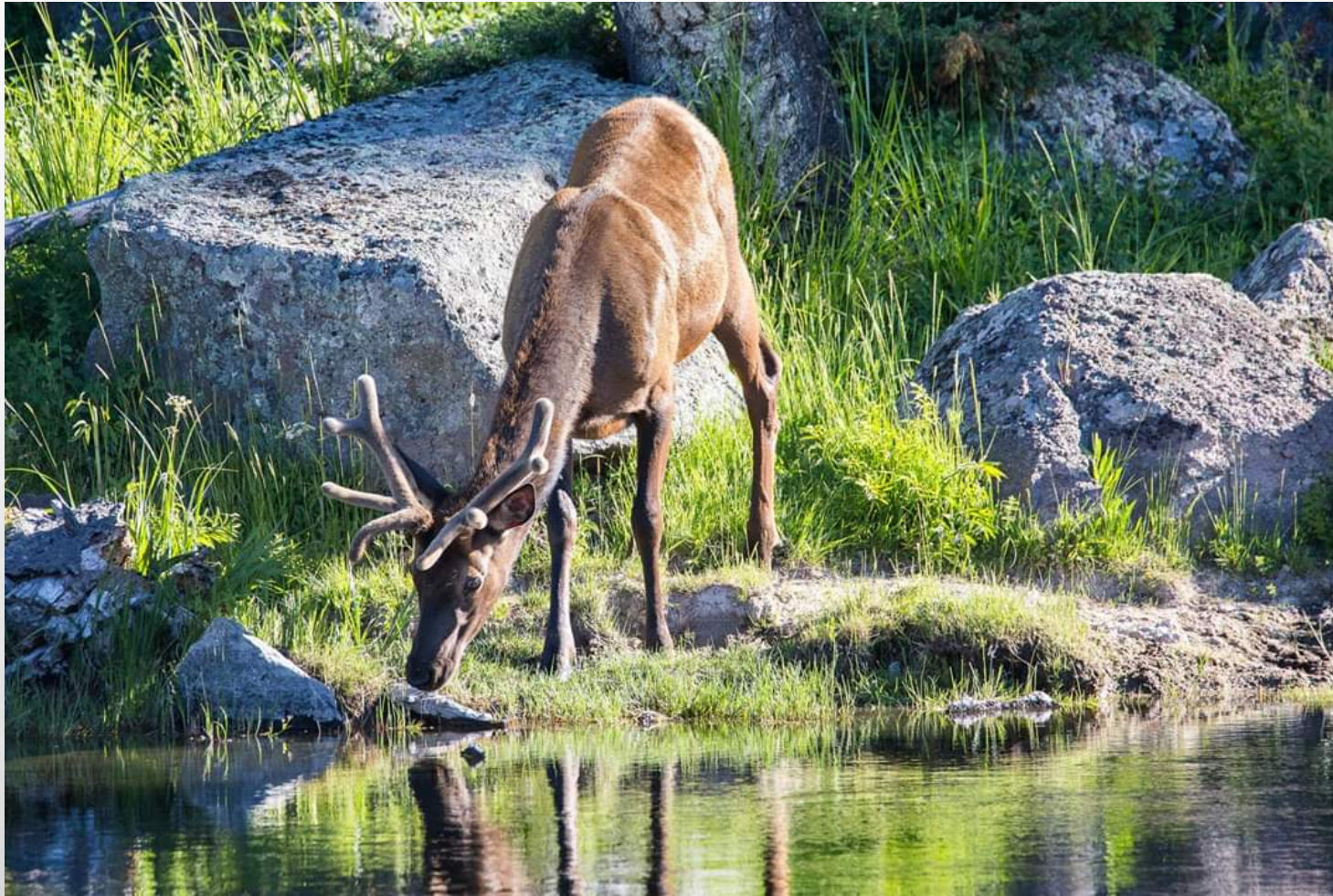
Yellowstone National Park 2020